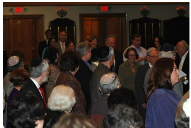
Kesher Zion Congregation