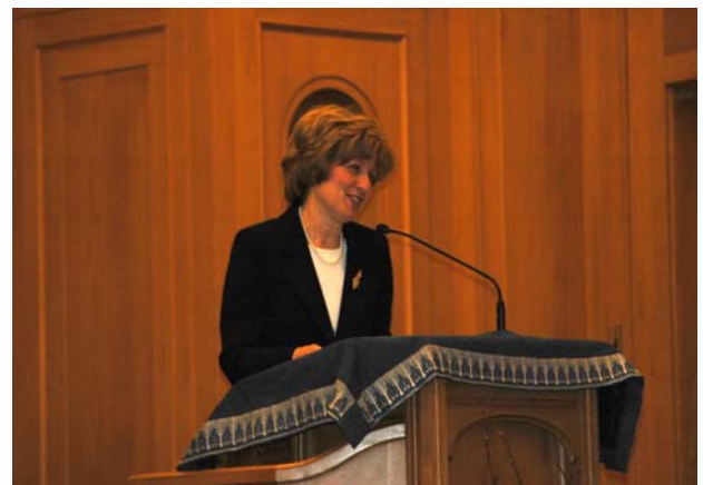
Senator Judith Schwank 11th District of Pennsylvania